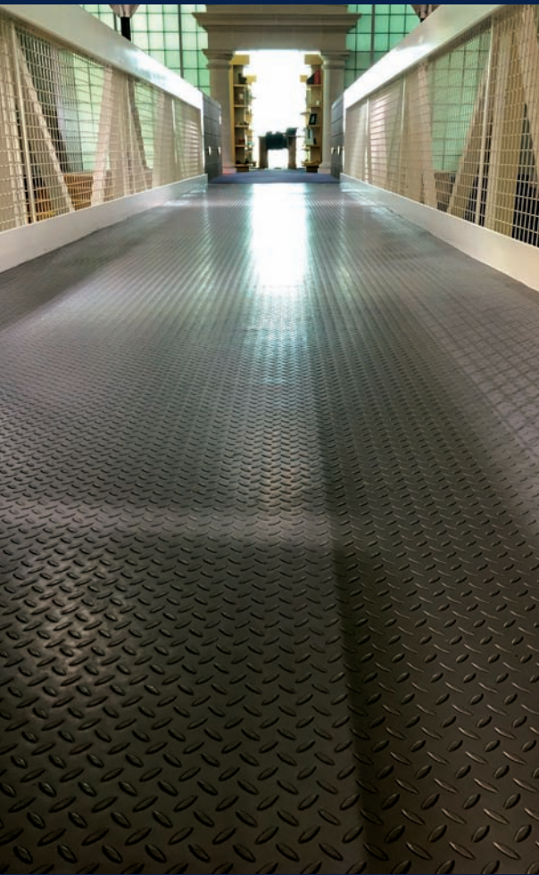
P161 Metallic Gray