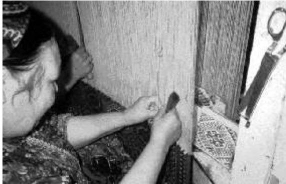
Fig. 2. Woman weaving a pile carpet in Ashkabad, Turkmenistan.