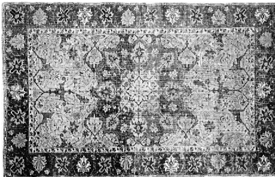
Fig. 1. Carpet with field surrounded by borders. Iran, 17th century. The Textile Museum (R33.1.3).

Necessarily, the analogue for “forces” must take into account the fact that Oriental carpets are the products of human hands. The pile is constructed of segments of wool (or other fibrous material) manipulated by the fingers around pairs of warps—the longitudinal set of elements held taut by the loom, which is a frame devised to hold these elements tight (see BEATTIE, 1983). Interlacing wefts create a fabric of warps and wefts; the knots, which form the pile, are supplementary to the foundation fabric. The pile carries the colors, designs, and patterns, while the warp and weft are generally hidden (Fig. 3).